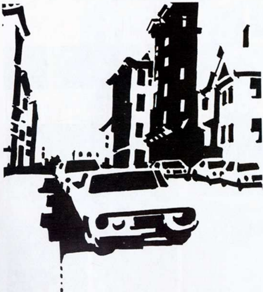
tone interpretation I (high contrast)