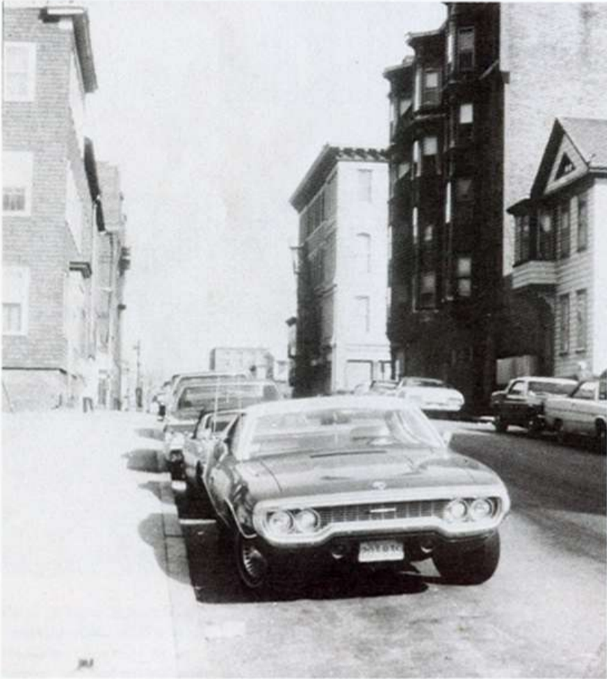
photograph of a street

EVERY TUESDAY THIS SEMESTER 09:30 / 12:30